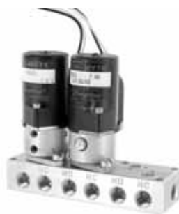
M41E1, M31E1 MM-3