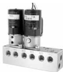
M41E1, M31E1 MMC-3